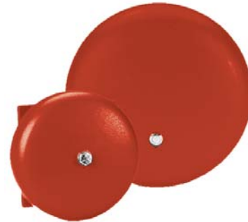
6-INCH and 10-INCH BELLS