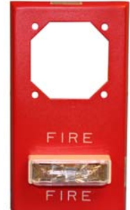
RSSP REMOTE PLATE