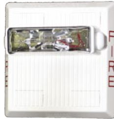
SERIES MT STROBE