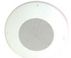
SERIES S Speaker