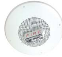
SERIES S-24MCC Speaker Strobe